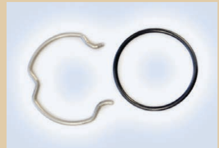
Metal lock for Striker Head item no.....096309