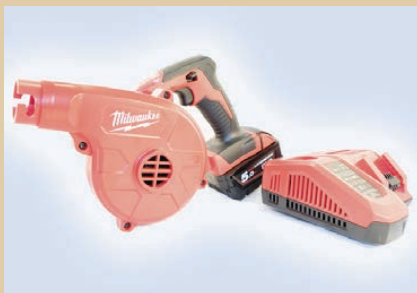
Striker Portable Inflator item no.....096308