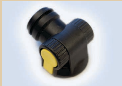
Striker Head item no.....096305