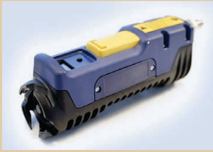
Digital inflator item no.....096302