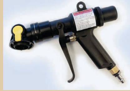
Striker inflator item no.....096304