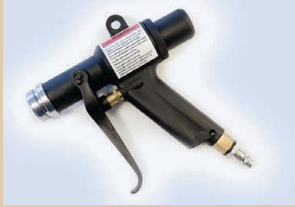
Turbo Striker item no.....096307