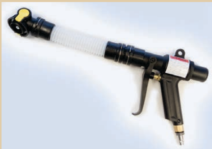
Striker Inflator Slinky item no.....096306