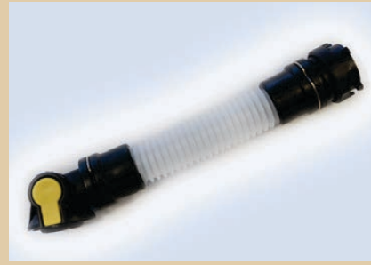
Striker Slinky (for digital inflator) item no.....096303