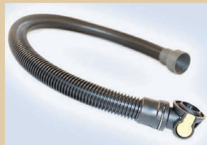
Hose for Striker Portable item no.....096310