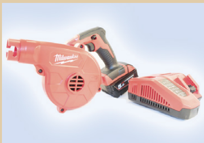
Striker Portable Inflator item no.....096308