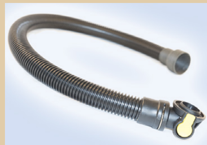
Hose for Striker Portable item no.....096310