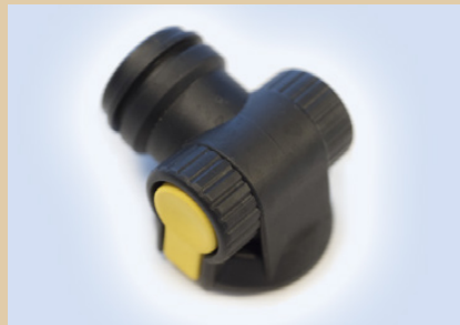
Striker Head item no.....096305