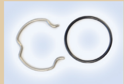
Metal lock for Striker Head item no.....096309