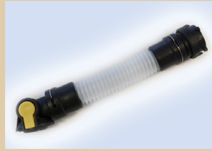
Striker Slinky (for digital inflator) item no.....096303