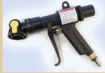
Striker inflator item no.....096304