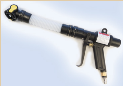
Striker Inflator Slinky item no.....096306